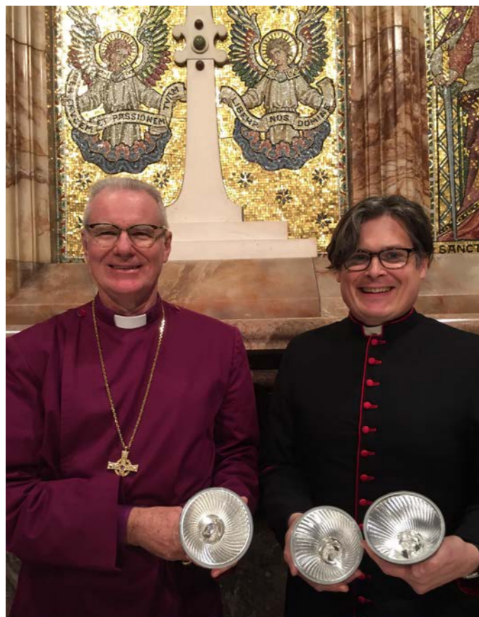
The Dean and Archbishop pose with the new LED bulbs to announce their installation in 2015.

St Paul's Cathedral's pioneering switch to LED lighting in 2015 has generated extraordinary returns, with inflation-adjusted savings now exceeding $1.6 million over the decade. The project, which cost $160,000 to implement, has exceeded all expectations in both financial returns and environmental impact.