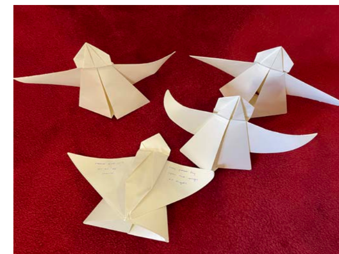
Above: Folded origami angels with written messages of peace made during a Craft Work Wednesday gathering.