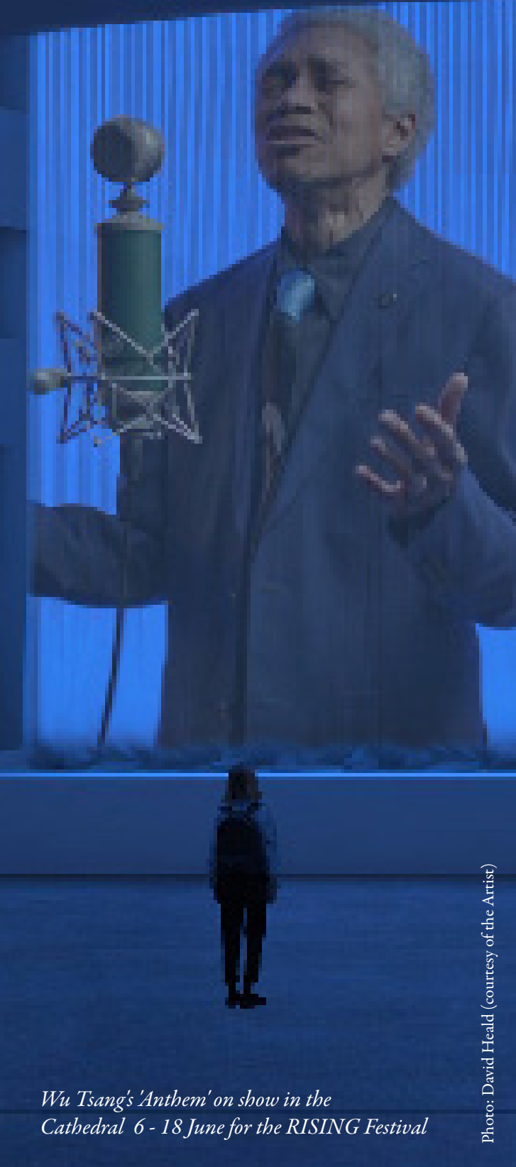
Wu Tsang's 'Anthem' on show in the Cathedral 6 - 18 June for the RISING Festival